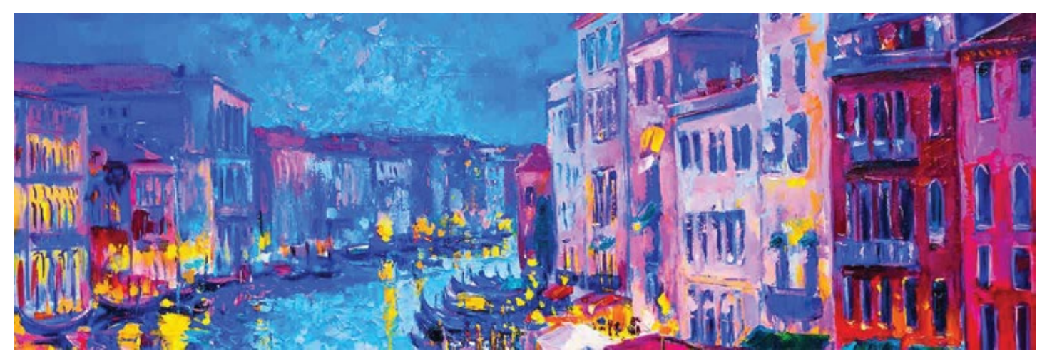
RGB colors are used when designing for light-based technology such as computer monitors, mobile de vices and televisions.