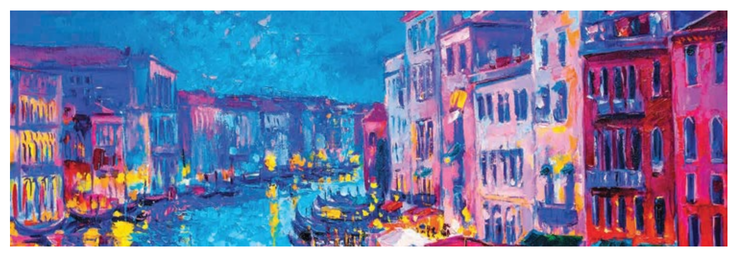
CMYK colors are the industry standard for printed materials and produce truer, more accurate color matching.